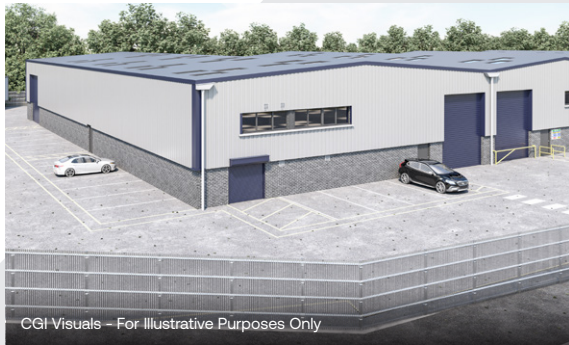
CGI Visuals – For Illustrative Purposes Only

Units 1 – 4 Grays Road, Green Elms Trading Estate, Uddingston, Glasgow G71 6ET